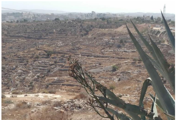
Bethlehem in the distance (Palestinian controlled)