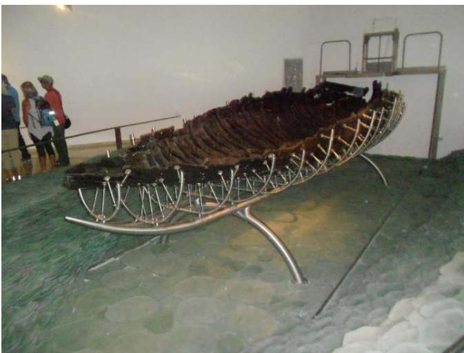
A recovered first-century Galilean fishing boat