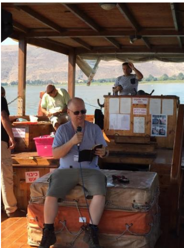
Teaching on Sea of Galilee